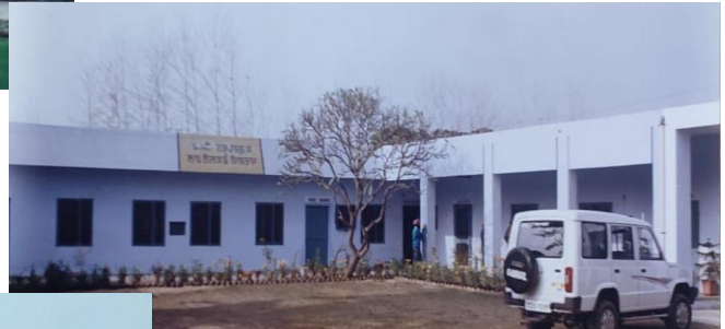
1993 Pharmacy Building View from inside of Building