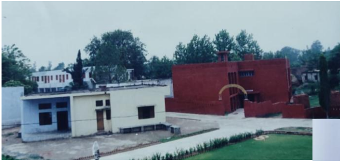
1993 Pharmacy Building View from outside of Building