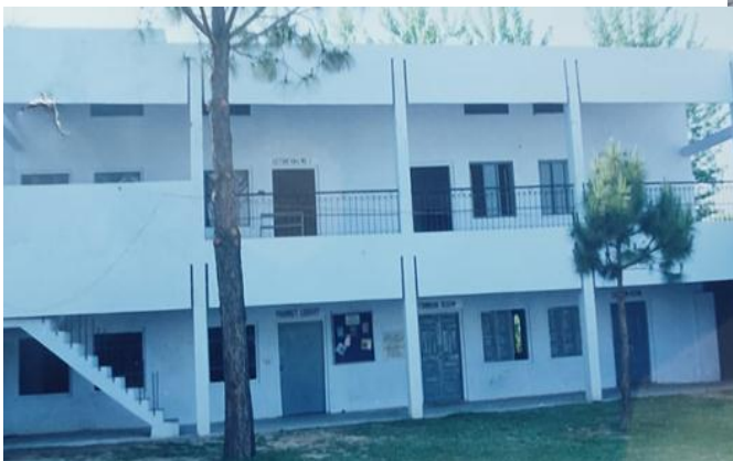
2000 Pharmacy Building View from inside of Building