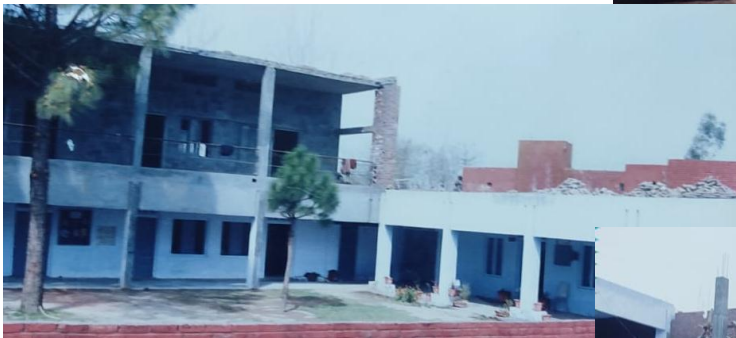
1999 Pharmacy Building View from inside of Building construction for Degree Program