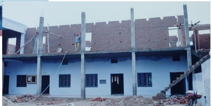
1999 Pharmacy Building View from inside of Building construction for Degree Program