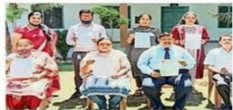
पेटेंट व कॉपीराइट प्राप्त करने वाले स्टॉफ़ मंडल।

भास्कर न्यूज़ | चमकौर साहिब 1970 की हुई थी। इस नवीनता व रचनात्मक उत्साहित करने के रूप जाता है। इस खल की मंडल द्वारा 2 पेटेंट