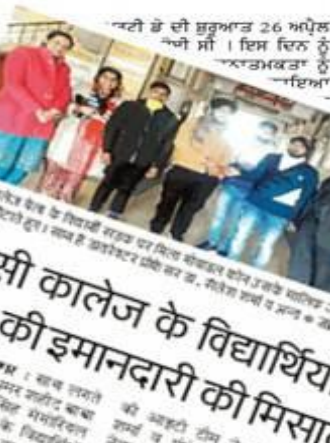
भास्कर न्यूज़ | चमकौर साहिब