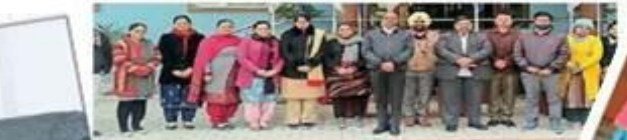
भास्कर न्यूज़ | चमकौर साहिब